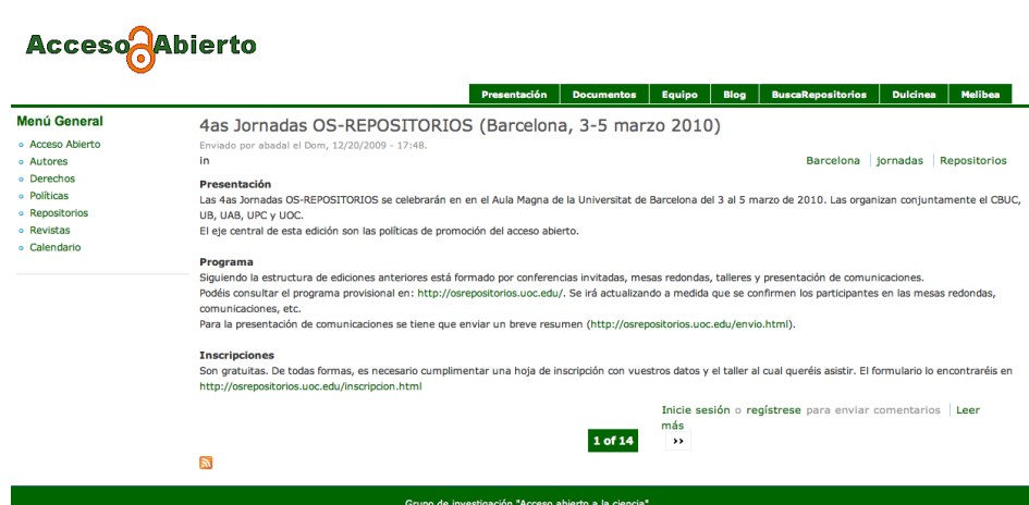
Figure 1. Main page of the accesoabierto.net portal

The accesoabierto.net portal (Figure 1) gives access to the following contents; Dulcinea, the database of copyright and self-archiving policies of Spanish scientific journals; BuscaRepositorios, database of Spanish repositories; Melibea, a validator of international open access policies. The web also includes a calendar of international events related to open access, a blog and a collection of papers published by the research group among which is included the 2009 report on the situation of Spanish institutional repositories conducted using the model of the survey followed by DRIVER as described in its inventory report of the European repositories published in 2007 (DRIVER, 2007).